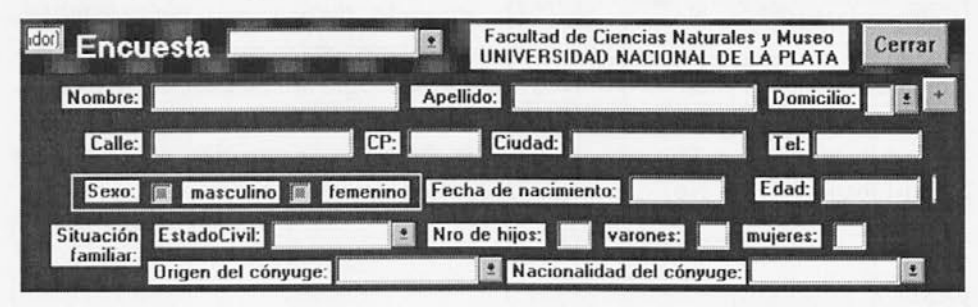
Figure 1: Top of the inquiry form. The fields with an arrow at the end allow only one specific selection of an answer. In this way the answers were standardized and errors were inhibited. The addresses were added in a codified mode to protect the personal information of the polled people.

The database is built as an application of the program MS-Access 2.0©. The minimum requirements of the hardware are a computer with a 80386 processor, 75 MHz and 8 MBRAM, Windows 3.1 or newer and MS-Access 2.0. The design of the application makes it easy to handle the data offering the user menus and control buttons. Upon starting, the user can choose from a main menu, which type of work he wants to elaborate. The system allows to receive data from various studies, to add and to modify data of the inquiries (figure 1) and to analyse these, concerning the field of interest, with the help of variable parametric queries (figure 2). Different options exist to extract and present prepared reports to show the results within tables (table 1) or diagrams (diagram 1).