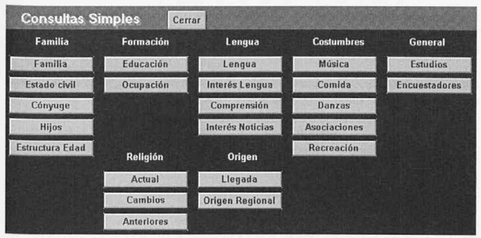
Figure 2: Query form of variable parameters, which allows a flexible analysis of the data.